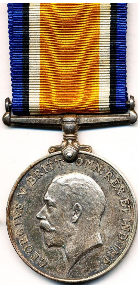
British War Medal